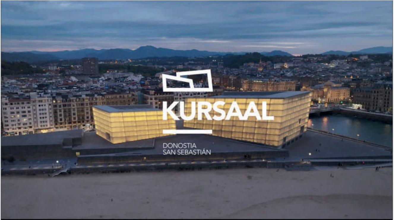
📍 Centro Kursaal Elkargunea Zurriola Avenue, 1, 20002. Donostia - San Sebastián

San Sebastian is a traditional and well-known destination for tourists and over the last few decades for conventions as well. The city has settled around the unique bay of La Concha (the Shell), and on the banks of the mouth of the river Urumea. Within the same district, mountains and beaches shape an exceptional display of urban scenery combining carefully tended architectural features with a unique natural landscape. San Sebastian is a city to enjoy by foot.